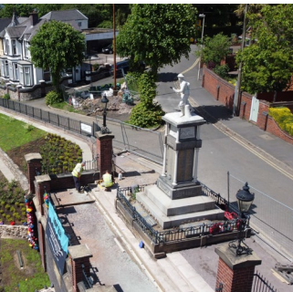
Brierley Hill War Memorial

Magdalen College Chapel- repairs and alterations to the organ chamber and screen to accept the installation of a new organ and casing, grade I Oriol College – refurbishment and upgrade of student facilities, grade I.