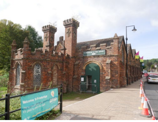
Museum of the Gorge, Ironbridge