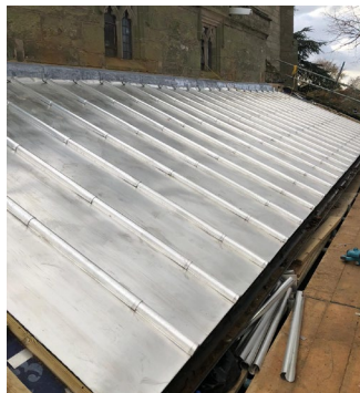
St. Chad, Bishops Tachbrook

Specialises in the conservation, repair and reuse of historic, traditional buildings, monuments and historic landscapes, with traditional and also environmentally friendly and sustainable building methods and materials.