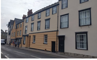
1-7 Longwall Street, Oxford