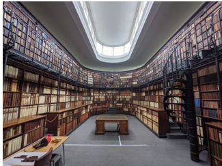
Birmingham Oratory Library

Working as a Technologist for several Midlands-based conservation architects exclusively on conservation and heritage projects including 2 years as a building surveyor for the National Trust with responsibilities for portfolios in Warwickshire, South Worcestershire and Northamptonshire.