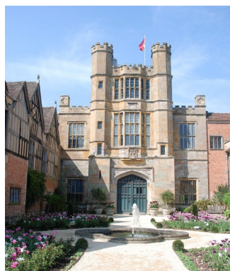
Coughton Court, Warwickshire

All Saints, Small Heath Birmingham – external repairs to the fabric, grade II*