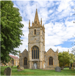
St. Lawrence, Evesham

Worked as an Architectural Stone Conservator (with an architectural background). Workload soon expanded to cover most building materials and a variety of construction techniques. Gained 12 years post qualification experience on site, working for many of the country's leading conservation contractors including running own building conservation firm. Moved back into the world of architecture in 2008. Achieving Chartered Architectural Technologist MCIAT status in 2013.