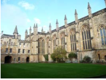
New College Chapel

Long Itchington, Warwickshire: Appointed church architect to this Grade II* listed church. Quinquennial inspection. Repairs to unstable masonry to Porch and Vestry. English Heritage grant aided repairs to Tower masonry and leadwork.