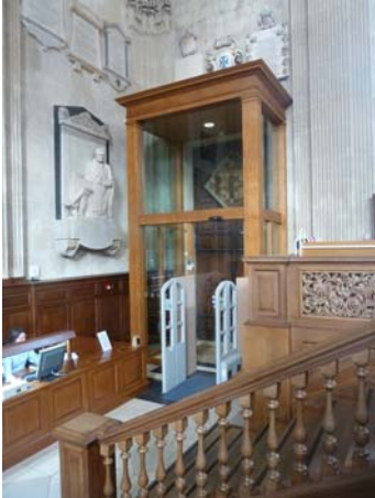
Lincoln College Library

Lincoln College, Oxford: Internal redesign of Upper SCR. New disabled access and internal porch to College library (former church of All Saints). Alterations and new extension to Garden Building, with Stanton Williams Architects.