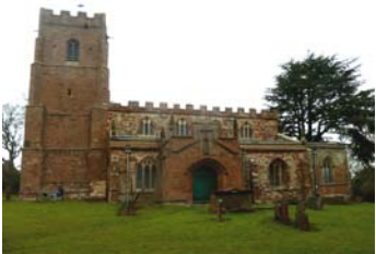
Newbold on Avon

New College, Oxford: Repairs to Grade I listed Chapel windows masonry and stained glass. Repairs to the 17th century stone floor to replace leaking heating pipes around the Epstein statue.