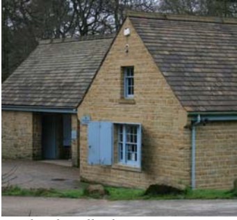
Hardwick Hall Education Centre

Hanbury Hall, Worcestershire: Quinquennial inspections for the National Trust. Reroofing to the Orangery and Stables. Report on repairs to the forecourt walls.