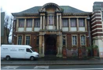
Moseley School of Art

New College, Oxford: New hall staircase handrail and upgrading of fire doors. Repairs to part of ancient City wall, a Scheduled Ancient Monument.