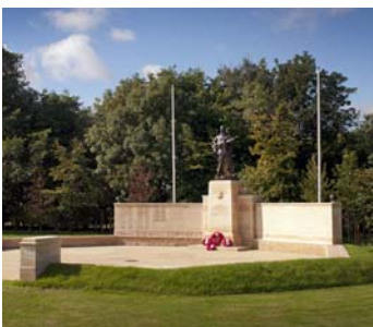
Royal Anglian Regiment, Duxford

Epworth Old Rectory, Lincolnshire: Fabric Condition Survey of Grade I listed museum, the childhood home of John Wesley. Specification for fabric repairs. Design for alterations to improve visitor facilities.